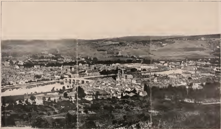
PONT-À-MOUSSON, THE MOSELLE, AND THE BOIS DE PRÉIRE BEFORE THE WAR

The Bois de Préire is the high ridge seen along the skyline above the church in the foreground